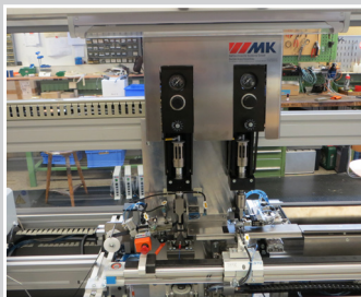
Ultrasonic welding machine for cutting the bra strap to length and sealing station for closure