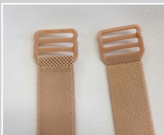
Sewing pattern Bra strap closure sealing