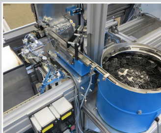
Ultrasonic welding machine with automatic closure component feed