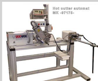
Cutting system, hot blade cutter 100 mm with tape dispenser on caster frame