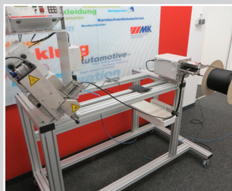
Cutting system, hot blade cutter 100 mm with tape dispenser on caster frame