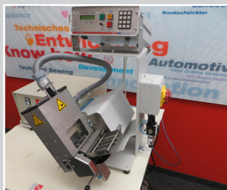
Hot blade cutter 100 mm