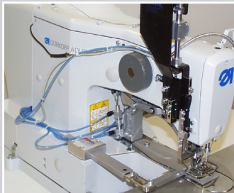
Thread wiper on an automatic locking unit