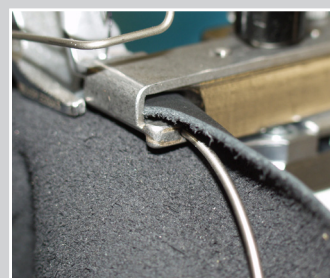
Special binder for gear gaiter with metal ring intake