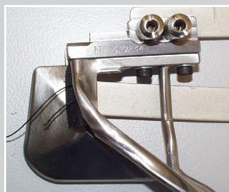
Special slanted binder