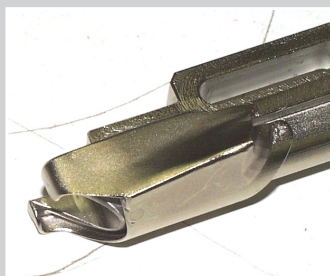
Special angled binder