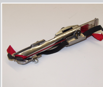
Angled binder with elastic band feed for swimwear