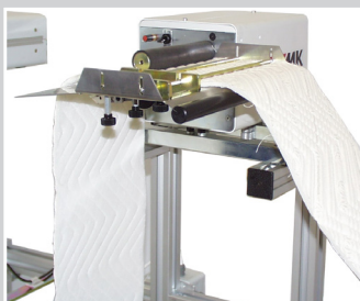
Large tape dispenser with transport roller 200 mm and sensor control