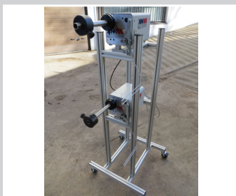
2x large tape dispensers , roll core drive with dancer control on caster frame