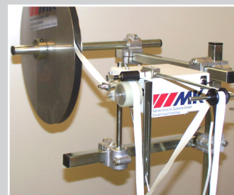
Small tape dispenser with transport roller 35 mm and dancer control