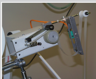
Small tape dispenser with transport roller 35 mm and sensor control