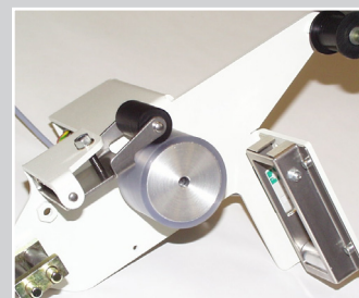
Tape dispenser, hot-air sealing machine without motor actuation