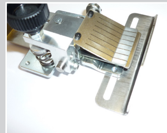
Mechanical tape brake