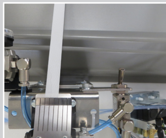
Pneumatic tape brake