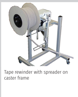
Tape rewriter with spreader on castor frame