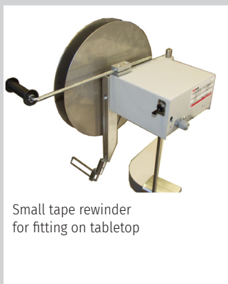
Small tape rewriter for fitting on tabletop