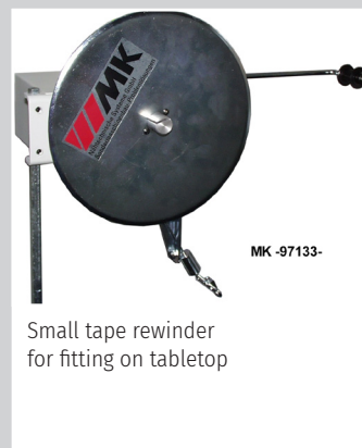
Small tape rewriter for fitting on tabletop