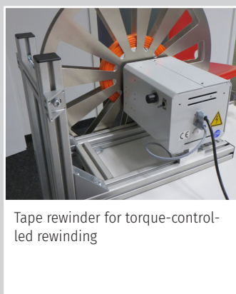
Tape rewriter for torque-controlled rewinding