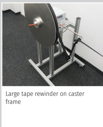
Large tape rewriter on castor frame