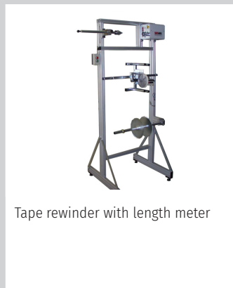
Tape rewriter with length meter