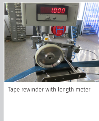
Tape rewriter with length meter