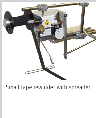
Small tape rewriter with spreader