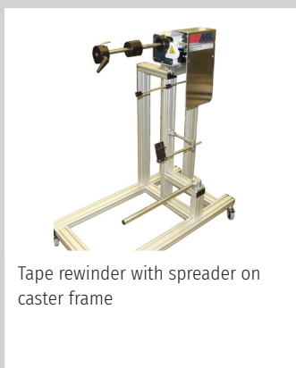
Tape rewriter with spreader on castor frame