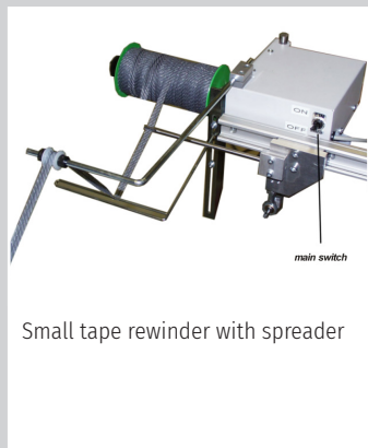
Small tape rewriter with spreader