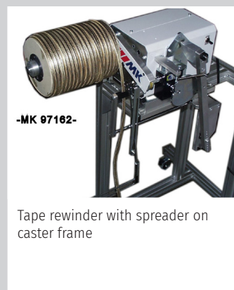
Tape rewriter with spreader on castor frame